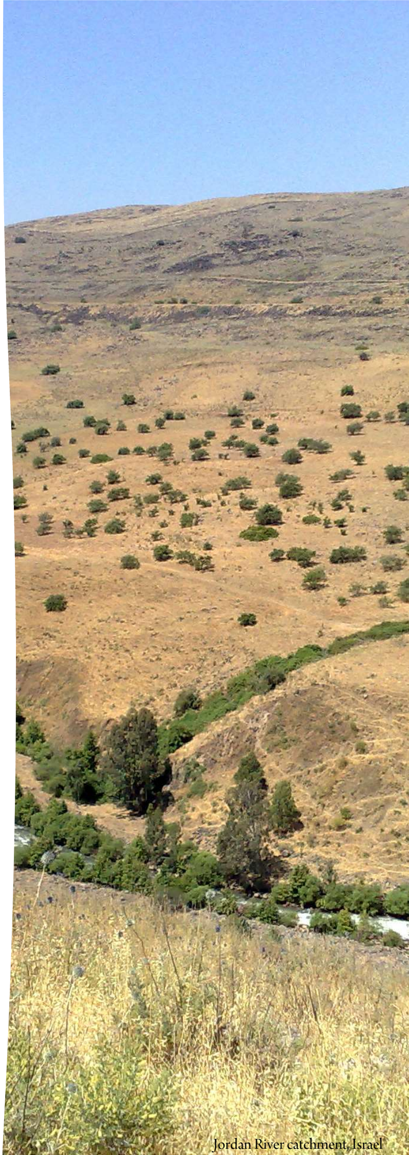
Jordan River catchment, Israel