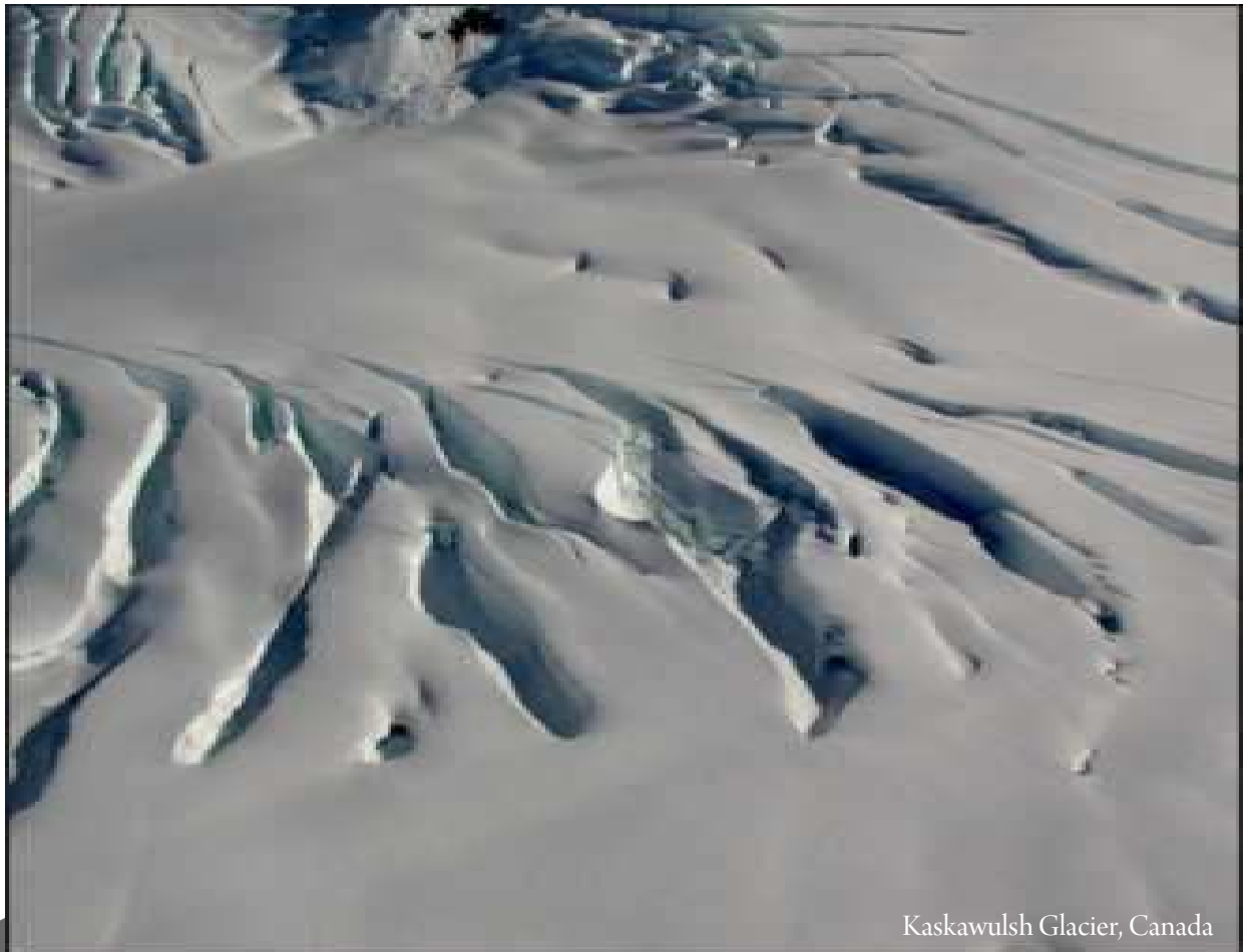
Kaskawulsh Glacier, Canada