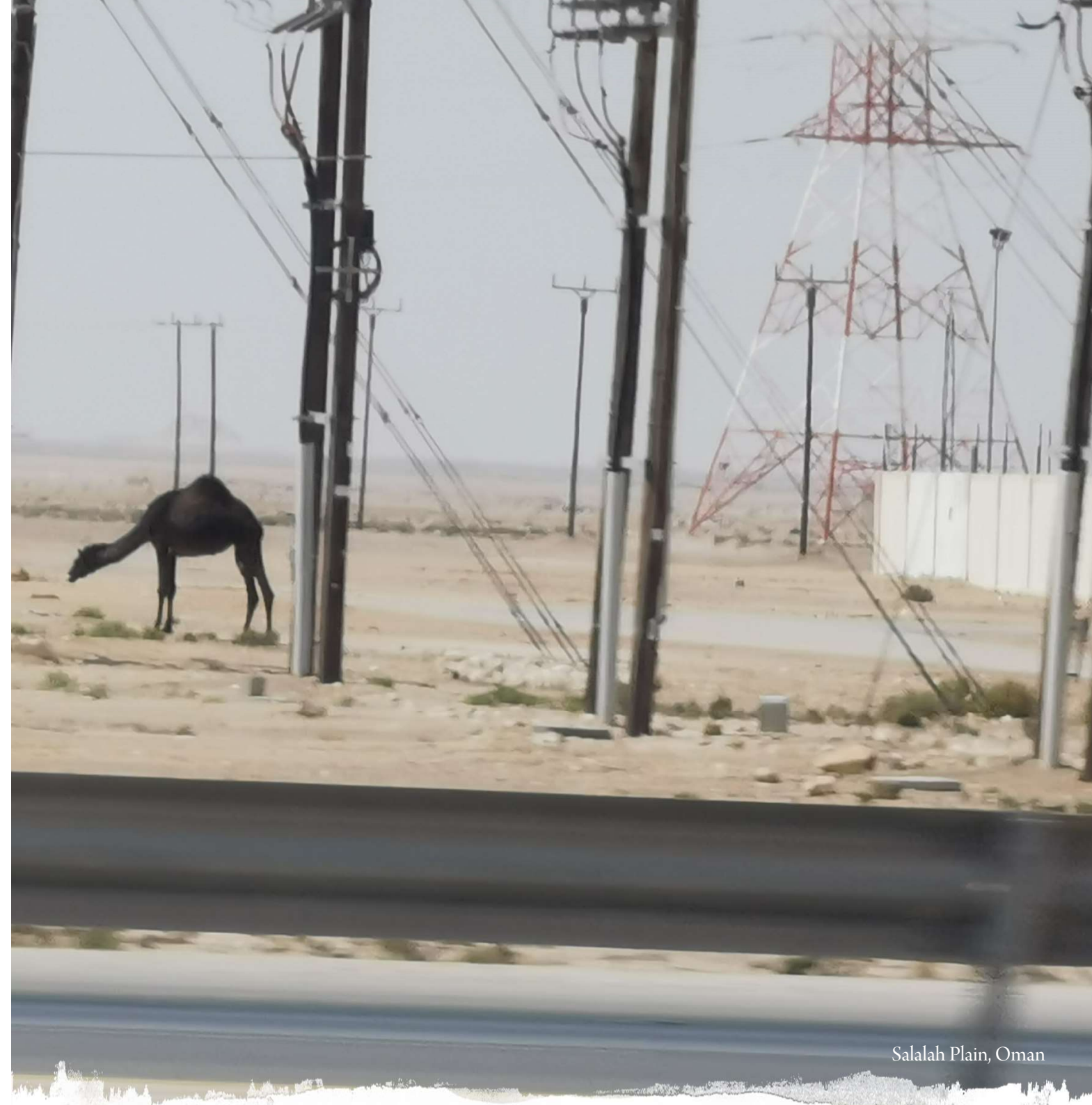
Salalah Plain, Oman