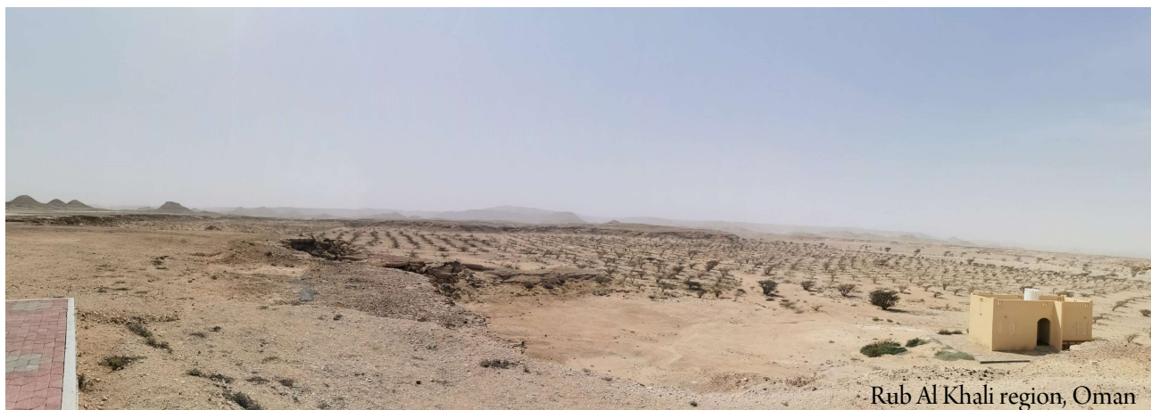
Rub Al Khali region, Oman